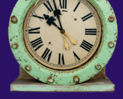
Bathing Clock, 1st third 20th century, Rollettmuseum Baden

The odour of sulphureous springs rises up out oft he depths, enveloping and pervading stories and destinies of the spa. Personalities from the past and future accompany visitors through the exhibition, tell anecdotes about their visit to Baden and make historical objects talk.